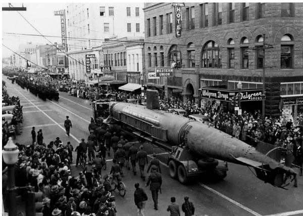
Westbound on Central Avenue, the captured Japanese submarine was the star attraction in Albuquerque's war bonds parade.

The 47-ton, 78-foot war prize arrived at the shipyard in Vallejo, California in January 1942. The U.S. Treasury Department's war bond tour was launched that October and cruised through New Mexico three months later. The sub – 90 feet long, from front grill to propellers – was hauled by a special tractor-trailer rig. It entered New Mexico on Highway 80 from Arizona and made port calls in Lordsburg, Deming and Las Cruces (including a round trip to El Paso), then cruised north on Highway 85 to Hatch, Hot Springs (now Truth or Consequences), Socorro, Belen and finally dropped anchor in Albuquerque on January 14, 1943. By mid-morning, an estimated 20,000 public-spirited citizens lined Central Avenue for the biggest parade ever staged in the city. The captured submarine inspired local residents and visitors from nearby towns to buy war bonds and stamps – $175,000 worth.