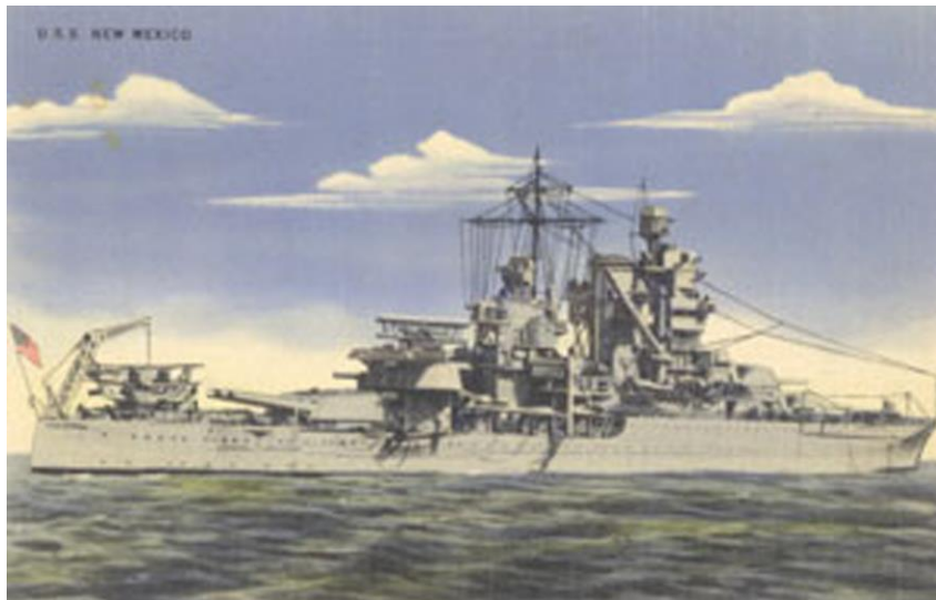
Vintage postcard shows the battleship USS New Mexico

Plus, 2019 Officers, Board Members To Be Elected During EMHS Annual Meeting Sunday, Nov. 11