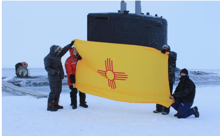
New Mexico's flag is unfurled as its namesake submarine surfaces 200 miles north of Prudhoe, Alaska.