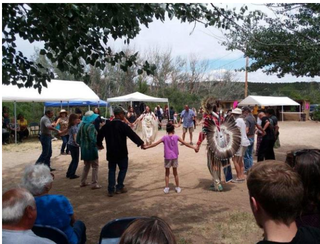
Community members joined dancers at the San Antonio bicentennial fiesta in June.