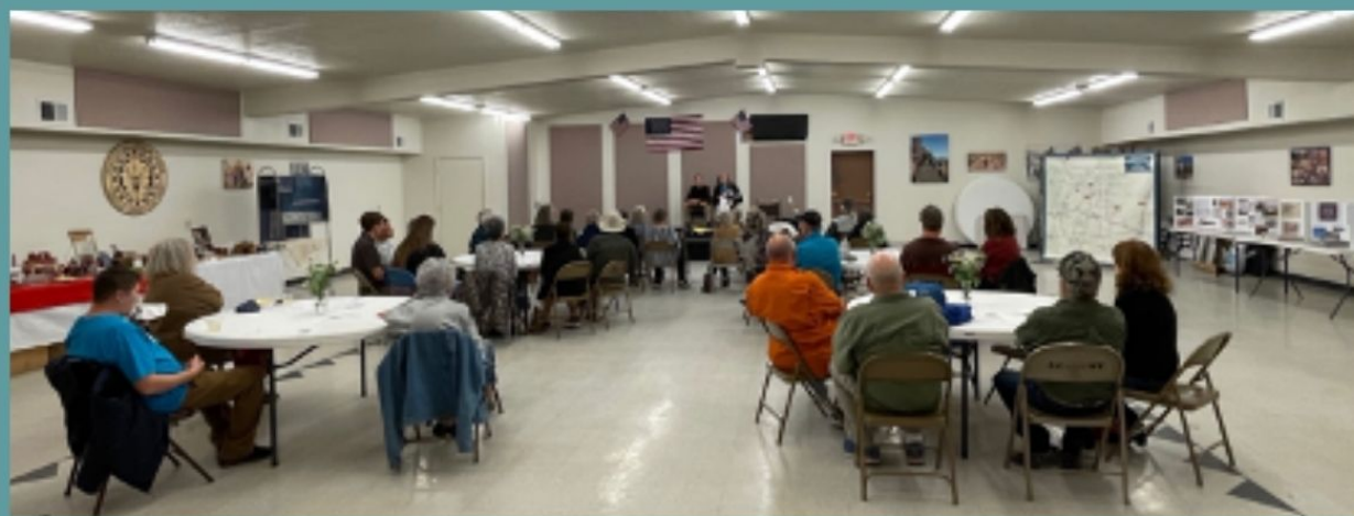
EMHS members, friends and special guests enjoy the program, historical displays, and refreshments in the Cañón De Carnué Land Grant Hall.