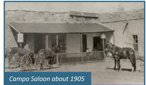
Campo Saloon about 1905

1862 – During the Civil War, Confederate troops were pushing north through the Territory of New Mexico. In the spring of 1862, troops set-up camp for several weeks at San Antonio. A soldier, A.B. Peticolas, kept a journal of his time in the war. His journal entry dated March 16, 1862 included a sketch of the Village of San Antonio. The drawing appears to indicate an enclosure or corral near the arroyo where the Campo House is currently located.