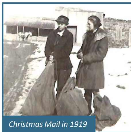
Christmas Mail in 1919