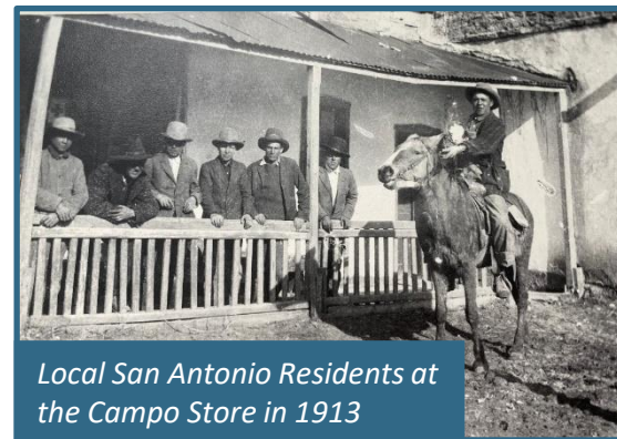
Local San Antonio Residents at the Campo Store in 1913